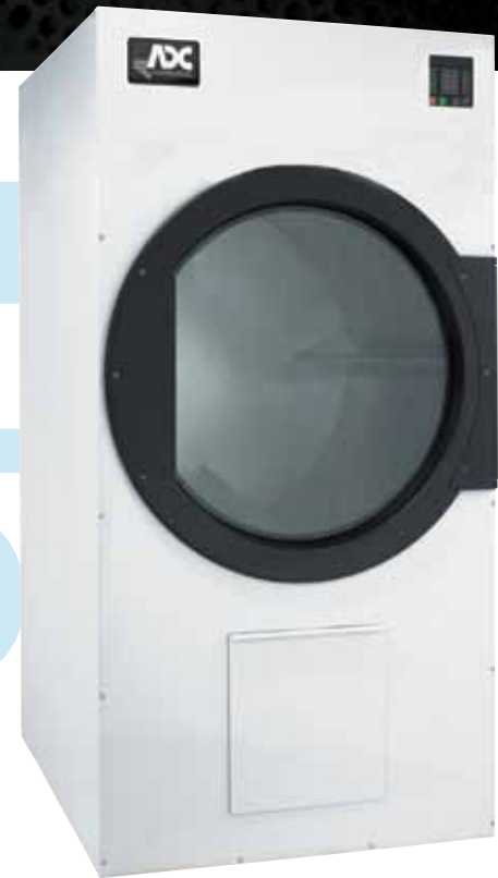
AD-115 OPL Dryer